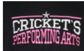
Warm up back logo

The Glitz design is available in the pink & aurora borealis rhinestones and now also green foil